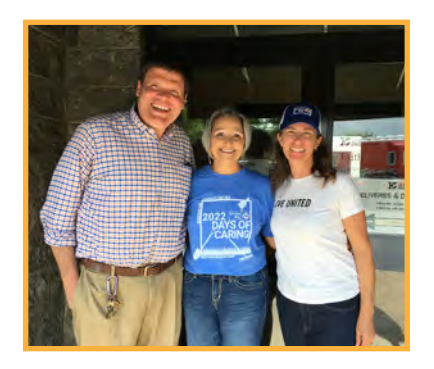
Wilsonart employees volunteered at Hendersonville Rescue Mission during our 2022 Days of Caring.

Wilsonart continues to lead the way in supporting United Way and our community. Their longstanding partnership through the years has resulted in a total investment of more than $2.5 million to support the health, education, financial stability and basic needs of their neighbors here in Henderson County. Whether it be fielding volunteers for Days of Caring, providing corporate sponsorship support, or engaging employees in United Way campaigns that consistently reach the highest overall total for employee giving in our area, Wilsonart demonstrates a spirit of corporate philanthropy that makes a big impact and is greatly appreciated.